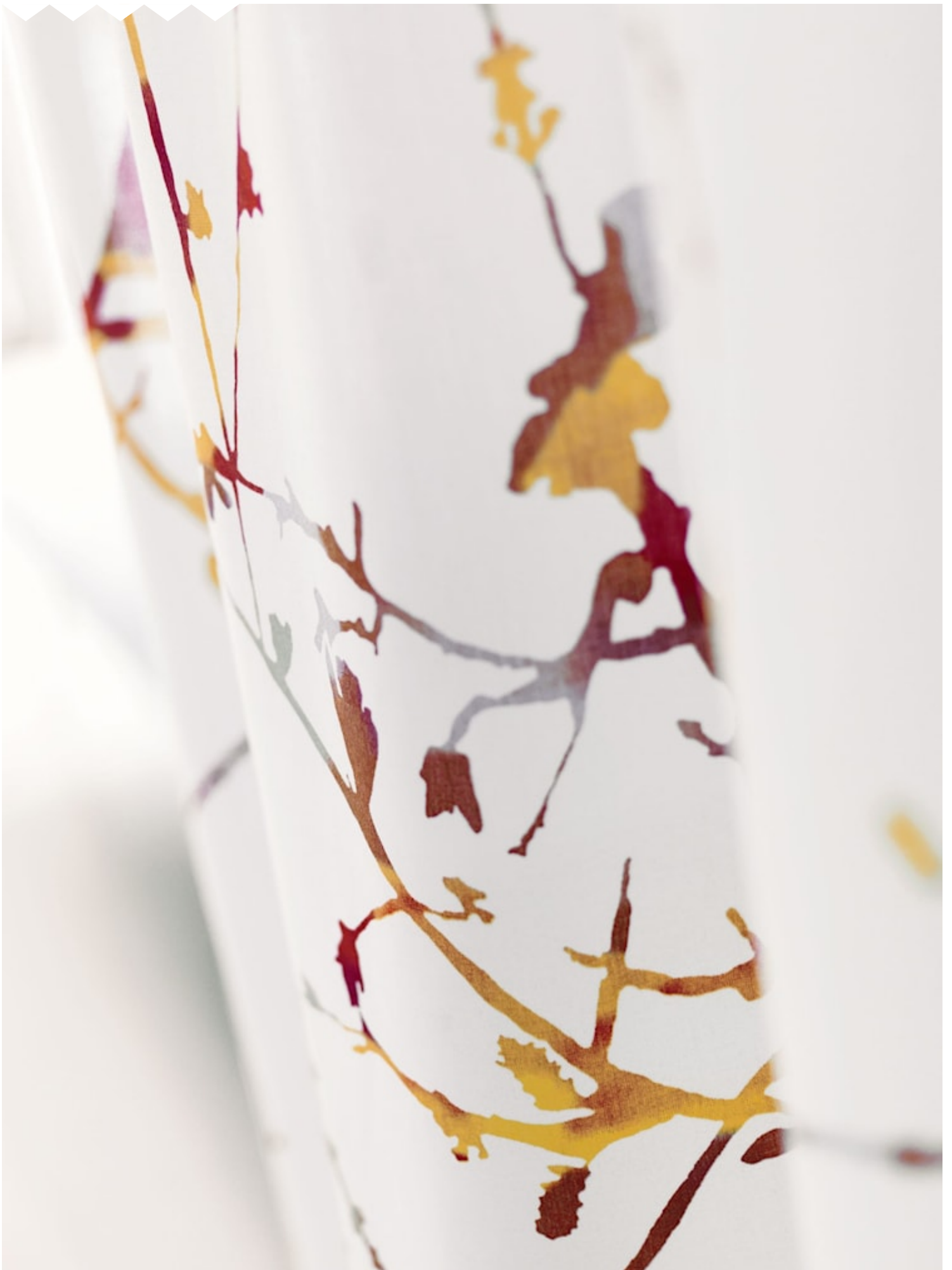
WILLOW Hanging fabrics