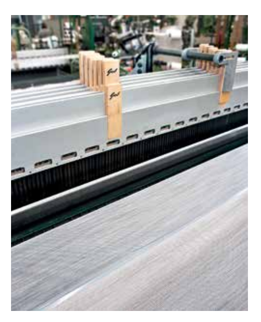
Ambiance made in Switzerland: ZETACOUSTIC fabric production

From development and design to preparing the yarn, weaving and finishing, Création Baumann acoustic fabrics are created in their own design studio and production facility in Langenthal, Switzerland. The wide range of products allows great flexibility when responding to market trends and customer requirements – with typical Création Baumann quality. Over 125 years of expertise is woven into each fabric, which is finished to top technical and environmental standards.